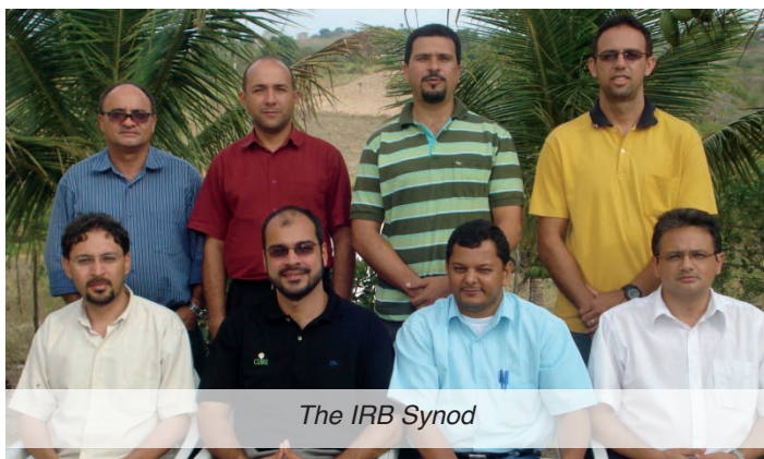
The IRB Synod