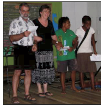
The 'West Papuans' singing a song

In what is fast becoming an annual event, students and staff of the Reformed Churches Bible College gathered on Friday 6th May to celebrate their place of origin.