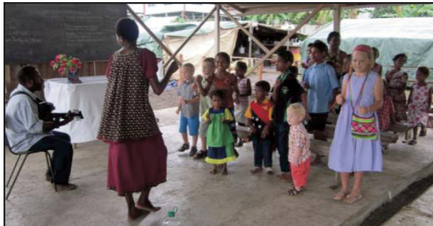
The Children's Bible School Program in Nine Mile Church.

Having many people of different cultures brings its own challenges and it is beneficial for us all to appreciate and celebrate each others ' differences.