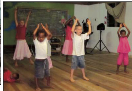
The children prepared an item for the evening...