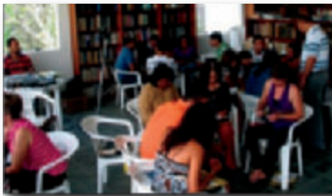
Busy teachers at the symposium

Schools that we support in Brazil were able to continue to operate. Escola Biblica Crista in Sao Jose is adding school grades, one in 2011 and another grade every following year.