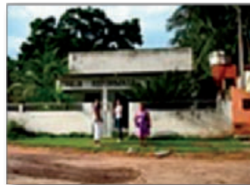
One of the Reformed Churches in Brazil