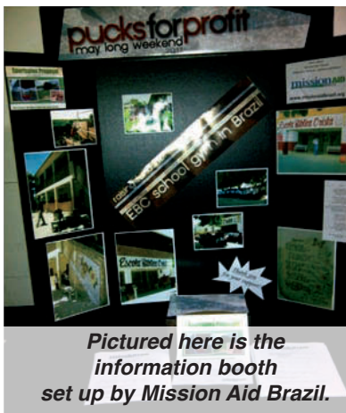
Pictured here is the information booth set up by Mission Aid Brazil.

The very well-run hockey tournament recently took place on the Victoria Day long weekend in Abbotsford, BC. At time of writing, it is not certain what the final figure will be, but the amount raised for the new Sportsplex at Escola Biblica Crista should be around $9,000.00! That is amazing, and the school in Brazil will put these funds to good use!