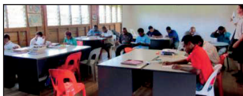
The English class of 2011.

As we daily spend time in the Word we pray that God will fill us anew with wonder and amazement for the wonderful love and grace He has given to us in Jesus Christ. May this knowledge strengthen our faith, and equip us for service in His Kingdom.